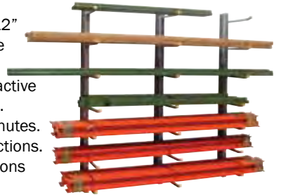
3 Sections Shown

This Cantilever Rack is the ideal wall mounted solution that stores bar stock, lumber and more. Each cantilever section features 7 arms for highly flexible storage. Unit can store up to 100 lbs. per arm or a total capacity of 700 lbs. Mount a series of sections along a wall to accommodate storage for extremely long stock. Each cantilever section measures 60"H; three arms measure 15" with a 7¼" clearance; four 12" arms that feature 9" clearances. Features an attractive zinc plated finish. Assembles in minutes. Sold in single sections. Minimum 2 sections needed.