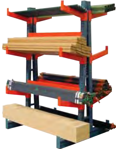
Double Sided Unit