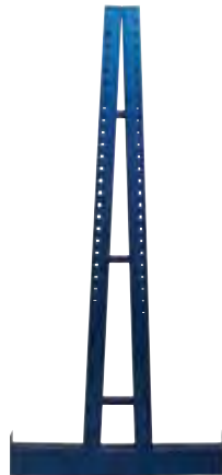
Double Sided Base/Columns Capacity 10,000 Lbs.