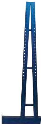
Single Sided Base/Columns Capacity 6,000 Lbs.