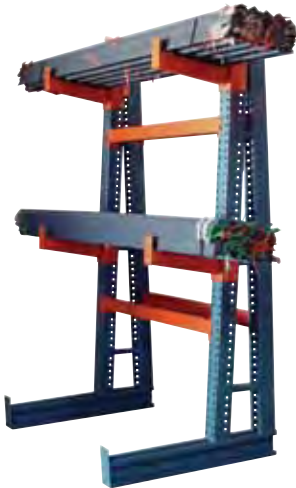
Single Sided Unit

Ideal for storing long products such as bars, pipes and rods. Available as either a single or double sided units. Two bases/columns, four brace beams and arms are required to make one free standing unit. All units are 79" tall. Arms are adjustable in 1½" increments. Choose either 12", 18" or 24" arms. Angled arms and welded end-stops provide secure/safe storage of long and/or irregular shaped merchandise. Connect multiple units to provide storage of extra long stock. Units assemble in less than 10 minutes.