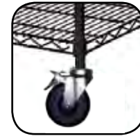
Mobile Posts (caster not included)