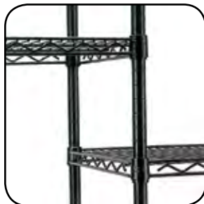
Utilize common posts to connect multiple units