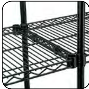
Add-On Units can be added using S-Hooks to create even shelf additions

Units are available in 63", 74" and 86" heights and include 4 shelves per unit.