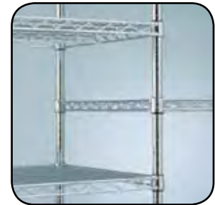
Utilize common posts to connect multiple units