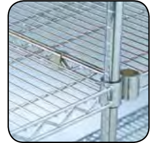
Add-On Units can be added using S-Hooks to create even shelf additions