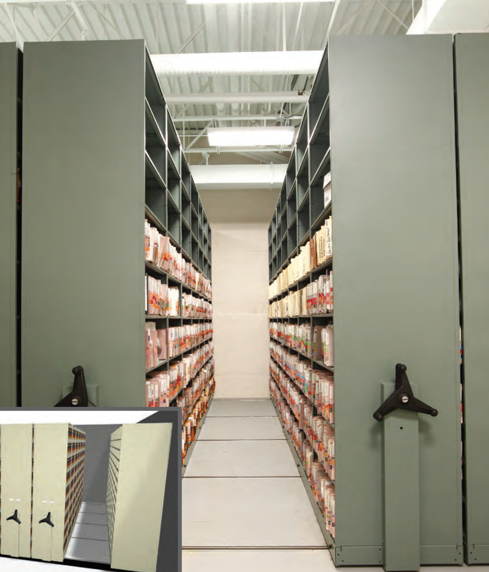
Even this custom height project for South Middleton Township was made a reality before it was ever built.