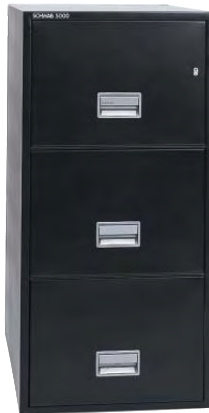
3CTC-5000: Three Drawer Vertical Legal Size File. Outside Dimensions: 40 19 / 32 "H x 19 7 / 8 "W x 31"D Inside Drawer Dimensions: 10 1 / 4 "H x 15 1 / 8 "W x 26"D Approximate Shipping Weight: 535 lbs.

Our after-the-fire free replacement guarantee lets you know that once you have made the investment in a Schwab file, we will be there even if disaster strikes. We stand behind it, and have for over a century.