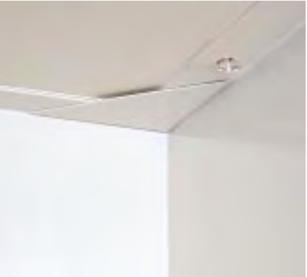
JETER Stax ¾" shelf lip, above.