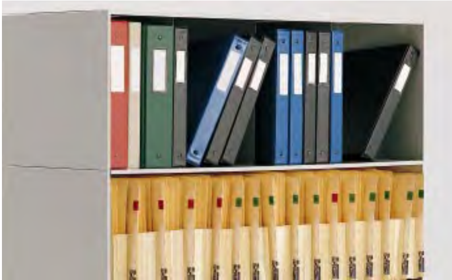
This legal-size file cabinet incorporates our NEW legal-size ring-binder shelf. These shelves can be located at any level within a legal-size cabinet.