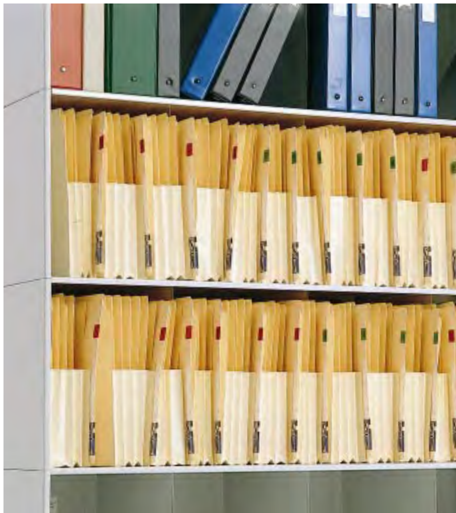
JETER Stax files allow you to store all types of media in one storage unit.

The full width of JETER cabinets is available for folders. Most 36" units sold by competitors have less than 36" available for folders. JETER cabinets accept folders equal to the full width of the unit. For example, JETER 48" units have 48" of filing capacity.