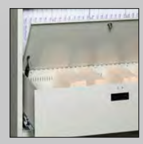
Confidential Files & Equipment