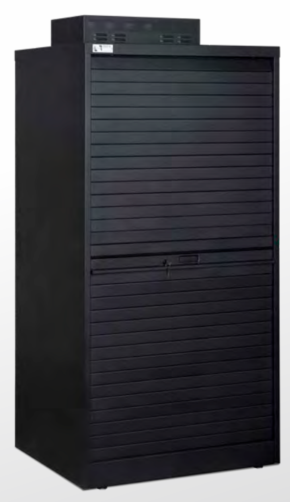
Available in 3 standard SANTEX finishes Beige, Grey or Black

The ULTIMATE PC Cabinet comes complete with (2) Monitor/Server Shelves, (1) Roll-out Printer/Server shelf, (1) Roll-out Keyboard shelf with retractable mouse wings. Other standard features are a 550 CFM exhaust fan that is controlled by a built in thermostat, rear cable entry flap, 6 outlet power strip, vented shelves and a all steel bi-parting tambour door with key lock. All internal components are shipped pre-installed and can be adjusted at any time.