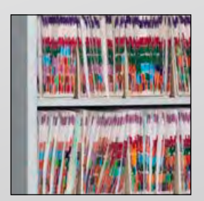
End Tab Files