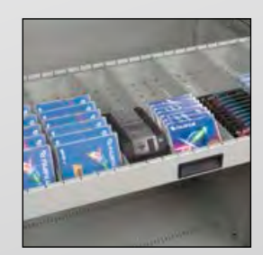
Computer & Video Cartridges