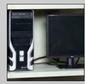
Sensitive Data Equipment