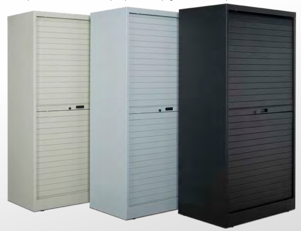
Media Storage Cabinets are 36" wide x 22" deep and come in 6 standard heights (36", 54", 60", 66", 72", 83"). Available in 3 standard SANTEX finishes Beige, Grey or Black

Our Multi-Media Cabinets have been the quality and durability standard in the industry for more than 40 years. The unique ALL-STEEL bi-parting tambour doors glide with ease on our special "aircraft cable track system". All cabinets come complete with lock & keys, ½" increment adjustment, heavy gauge steel construction and a durable powder coat finish. Cabinets are pre-assembled with any components you choose and ready to use upon arrival - No Assembly required. See page 8 & 9 for components.