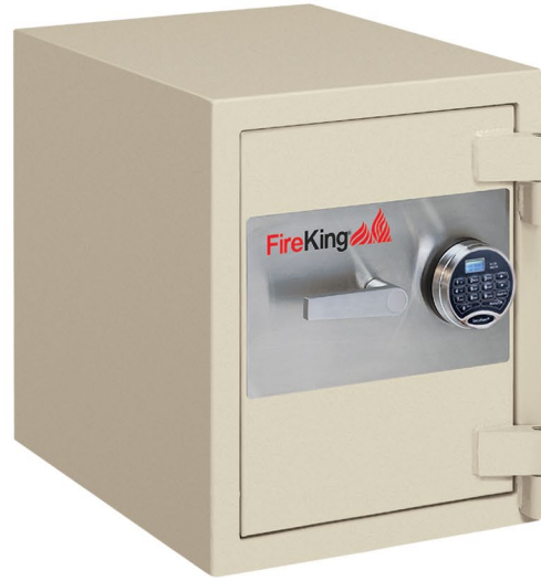
FB1612-1 Shown in Taupe with optional electronic lock