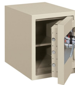
For added security, a 1/4" anchor hole comes standard in the bottom of the safe.