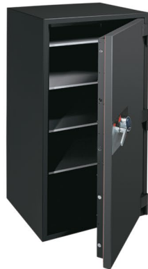
Comes standard with four shelves.