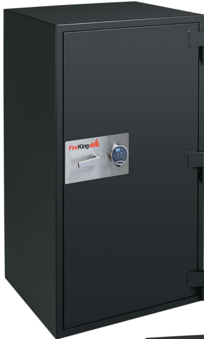
FB5428-1 Shown in Graphite with optional electronic lock