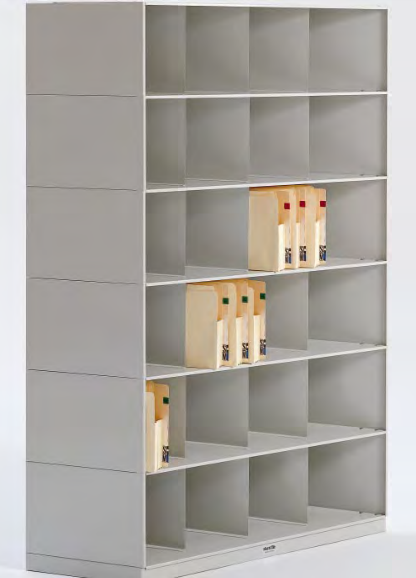
Legal-size Slant file with expansion pockets.

*W dimension is starter-section width for Slant files only.