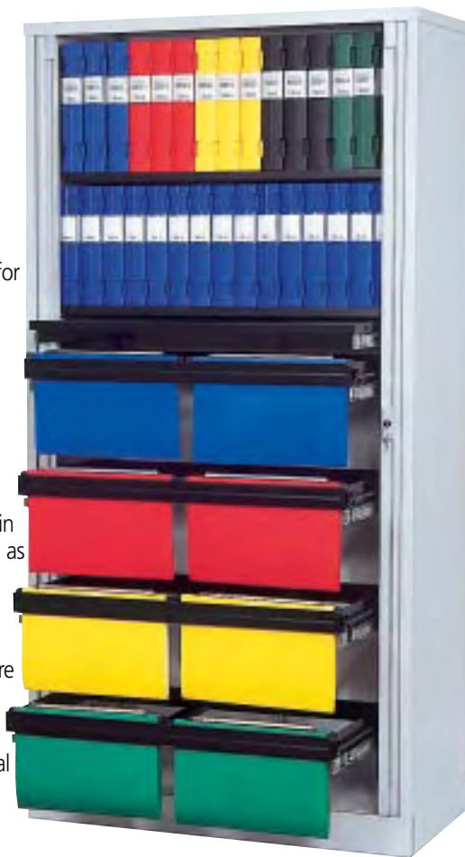
78" high cabinet shown with 2 Stationary Shelves, 1 Roll-out Shelf and 4 Roll-out File Frames.

Cabinets are shipped flat, ready to assemble.