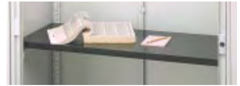
Stationary Shelf. Store magazine files, manuals, binders, and more. Allow 1 3/4" clearance, plus height of materials to be stored. Stationary Shelf ..... PBBS

Select any of these components to customize your storage needs.