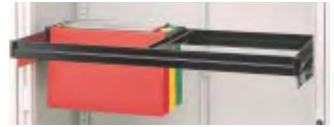
Roll-out File Frame. Pulls out to store 31" of hanging files, front-to-back or side-to-side. Allow 10 7/8" height clearance. Roll-out File Frame ..... PBRFA