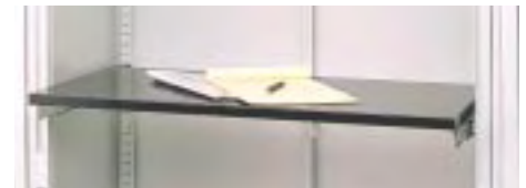
Roll-out Shelf. On-demand 32" x 16" work surface on smooth-rolling glides. Allow at least 3" height clearance. Roll-out Shelf ..... PBRS