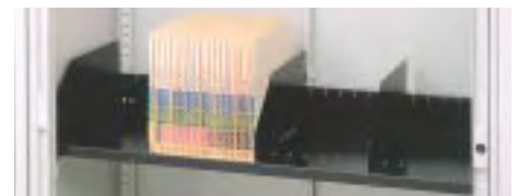
Slotted Shelf with Dividers. Includes five dividers. Ideal for end-tab files, binders, manuals. Allow 7" clearance, plus material height. Slotted Shelf with Dividers ..... PBSSBSD