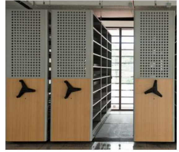
Custom Melamine & Perforated Steel