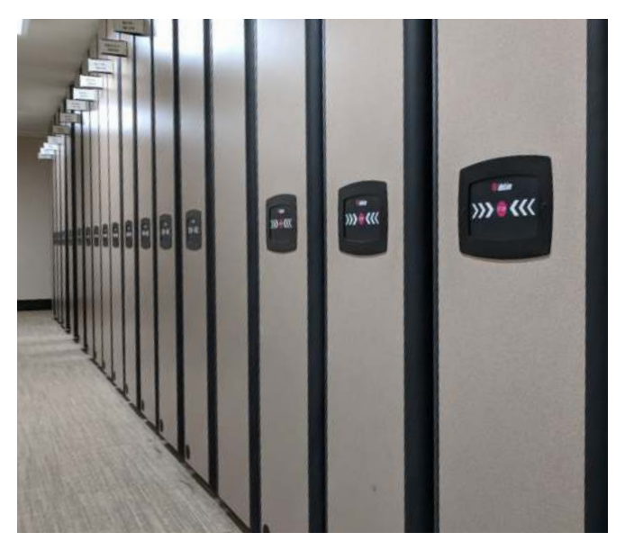
One-Piece Melamine End Panel

MobileTrak® Powered provides high-density storage within a complete system designed for maximum safety, productivity, and convenience. MobileTrak Powered includes simple, one-touch controls to access storage aisles, and standard features such as IR Floor Sweep, Manual Override, and Distance Sensors help protect the safety of both personnel and property. Additional options such as Aisle Entry Sensors, Aisle Lighting, Advanced Safety Systems, Power Lock, and Fire Park are available for even greater safety and security.