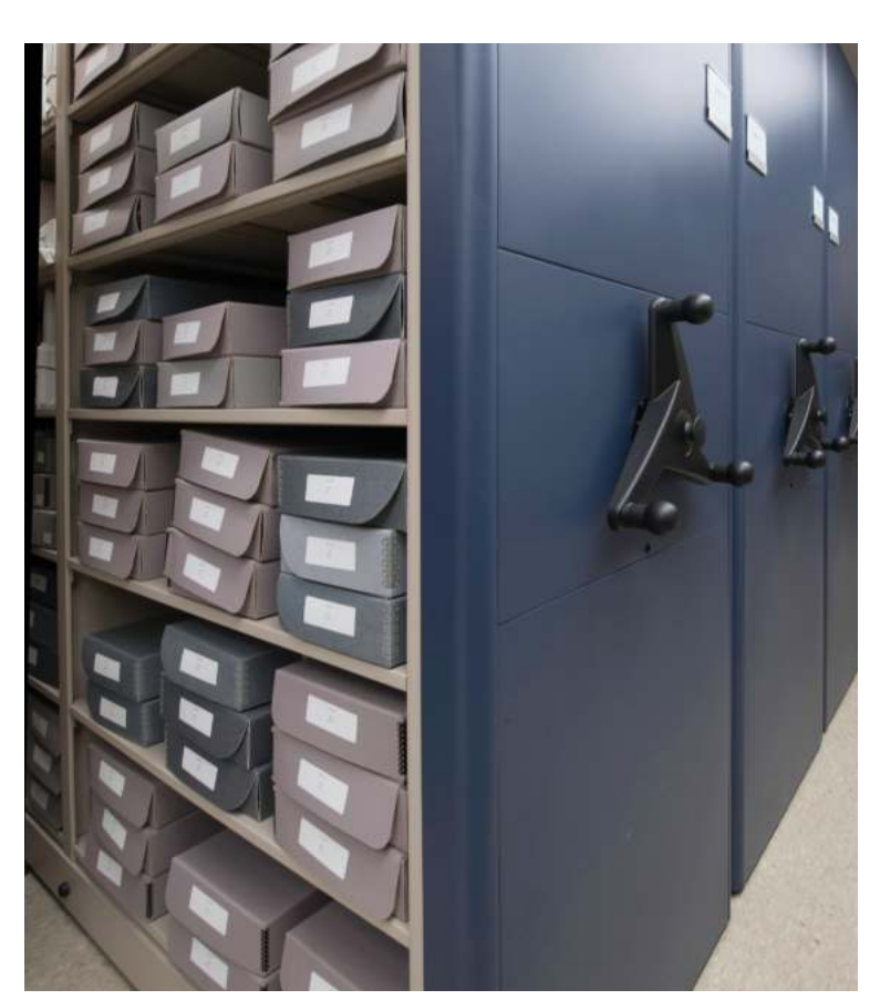
Three-Piece Steel End Panels

The MobileTrak550 is available as a Manual, Mechanical, or Powered system.