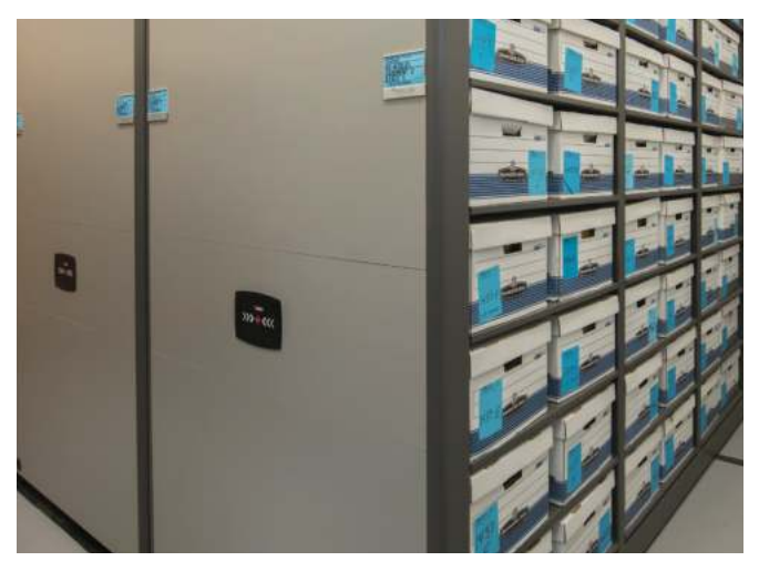
Three-Piece Melamine End Panel