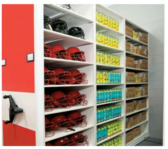
Three-Piece Laminate End Panel