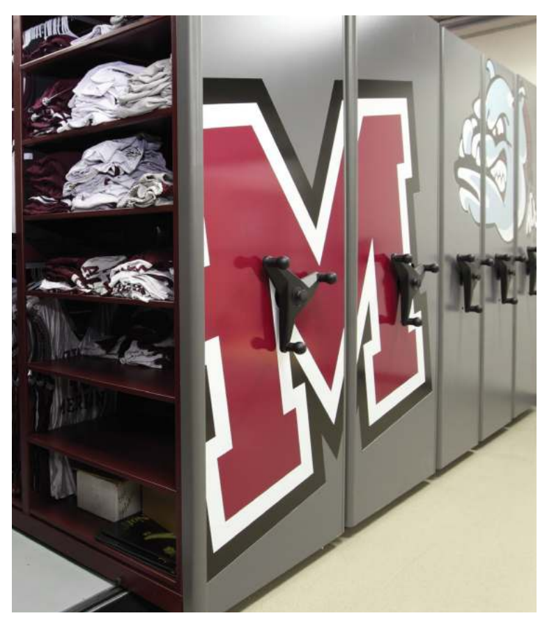
One-Piece Melamine with custom graphics

The MobileTrak3 is available with mechanical or manual carriages and with optional Dual Drive capability and Syncro Drive features.